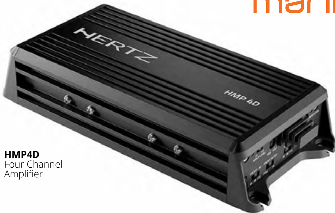
HMP4D Four Channel Amplifier